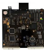
AMC-IP VERSION 11