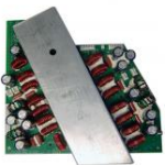
EAM-400 Item Number: 1023922400