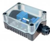
ELTSI-1 Item Number: 1023540000