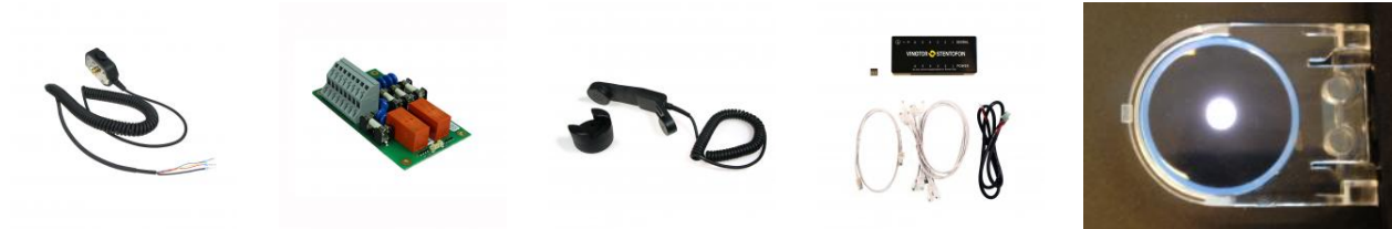
EMMAI-2H Item Number: 1023533312 TA-10 Item Number: 1008140100 TA-23 Item Number: 1008140230 EPIPR-6 Item Number: 1023697006 EGA-1 Item Number: 1023594100