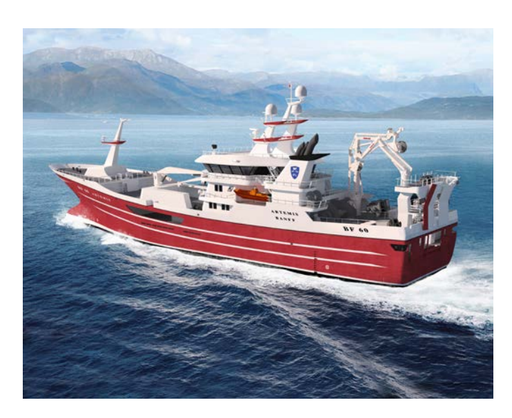
2 X Wärtsilä 12V14 gensets are scheduled for delivery in June 2022 for the new Pelagic Trawler newbuilding "Artemis" by Karstensen Shipyard.

The engine has been developed in collaboration with Liebherr, a leading global manufacturer of machinery and components. Liebherr engines have been developed for heavy duty applications and for operation under harsh environmental conditions. They are, therefore, a perfect fit for marine and offshore applications.