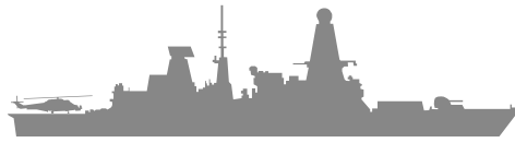
For navy ships