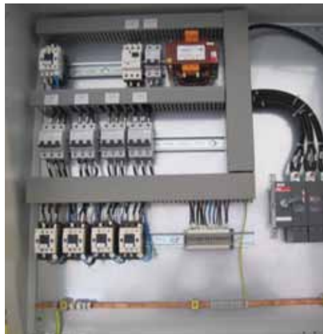
Control panel for the Aalborg EH electrical heater